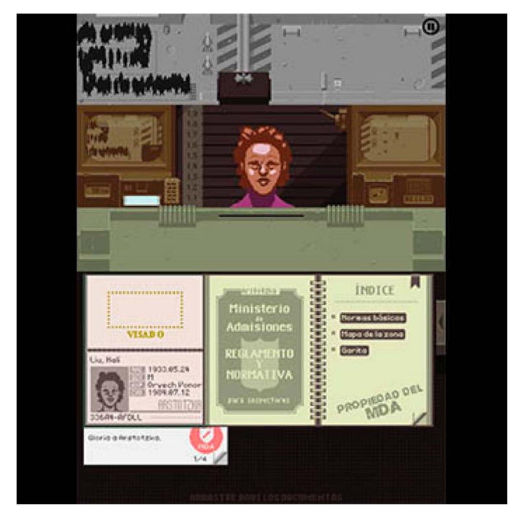
Fig. 4. Papers, please (Lucas Pope, 2012)

job extremely difficult. Sometimes we will have to deal with scripted migrants whose stories introduce moral dilemmas hard to resolve: must we obey the law and separate a family or just turn a blind eye on them? Should we deny access to a man who has all the papers in order just because the girl who applied before him told us that he had raped her? Can we allow illegal activities of rebels or act for the state and punish them?